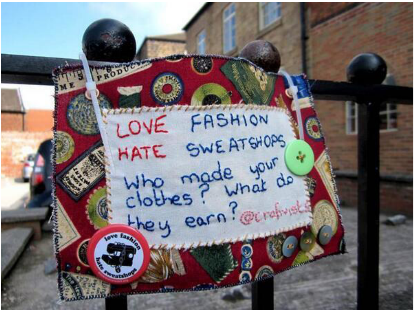
[Figure 7] Courtyard of Somerset House. London fashion week September 2012.

art of Gentle Protest : “The Creative Director of Bystander Revolution, Michael Wood, writes that: “Transforming something as everyday and disposable as a sticky note into a hand-stitched, lasting message reminds us that with a little bit of effort and creativity, a few simple words can make an indelible impact” (Corbett, cap. 6)