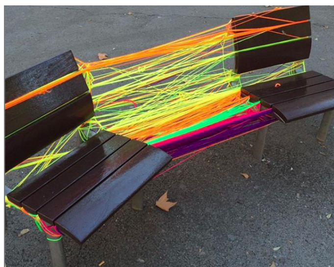
[Figure 8] -Extended bench by the collective Deb-van_deE

33 - Corbett provides examples of material, real-world changes won by craftivist campaigns. One of her most famous achievements was helping to secure higher wages for retail employees at Marks & Spencer https://ideas.ted.com/how-a-gentle-protest-with-hand-embroidered-hankies-helped-bring-higher-wages-for-retail-employees/