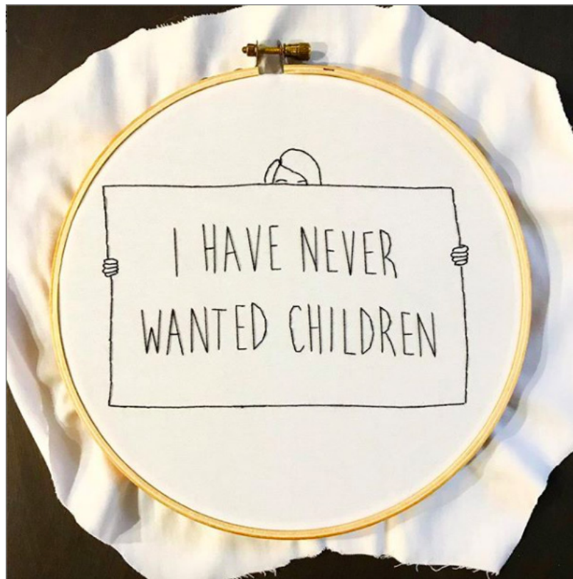
[Figure 6] - Shannon Downey (Badass Cross Stitch) (Chicago 1978)

In Strange Materials , Prain wonders about the difference between writing out a message on paper or on textile: “Why commit words onto cloth rather than into the pages of a journal? What makes textiles different than paper?” (Prain 103). Her core argument is twofold. On the one hand, she posits that the medium is both simple and powerful enough to trigger memories and emotions, therefore helping us establish an immediate connection