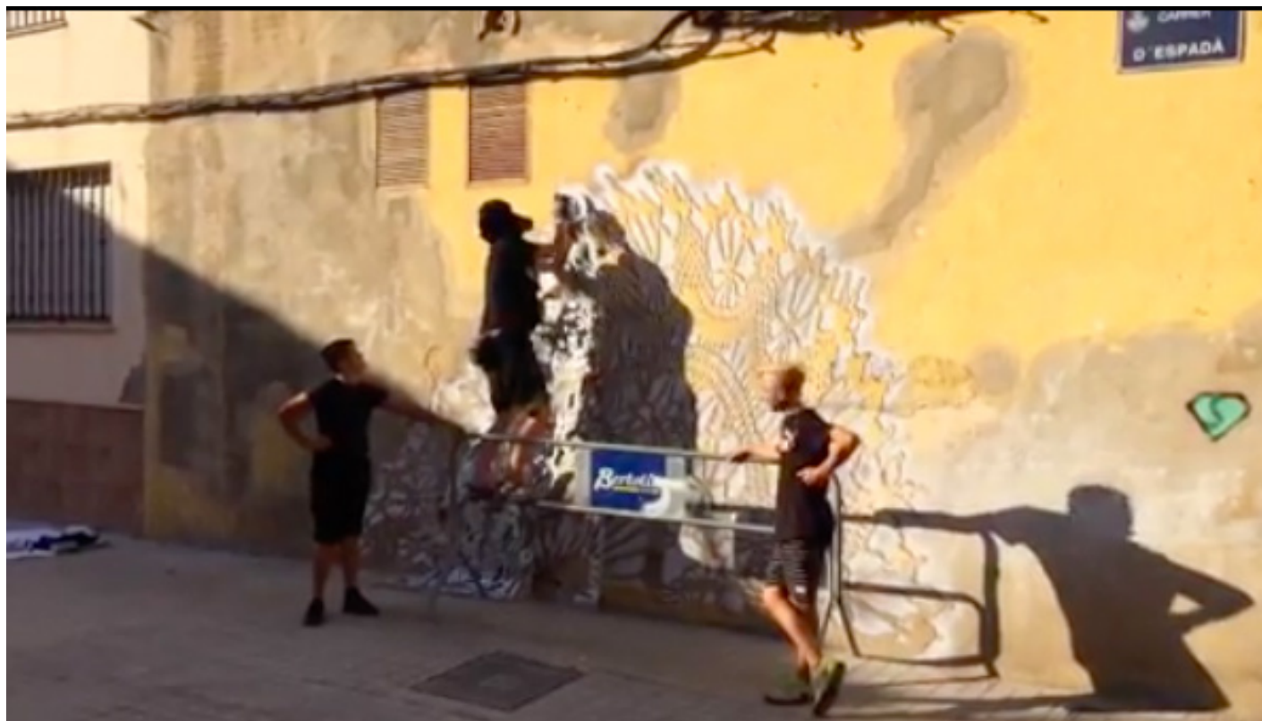
[Figure 13] Shot from a video of NeSpoon using a doily as a stencil. El Cabañal, Valencia, 2017.