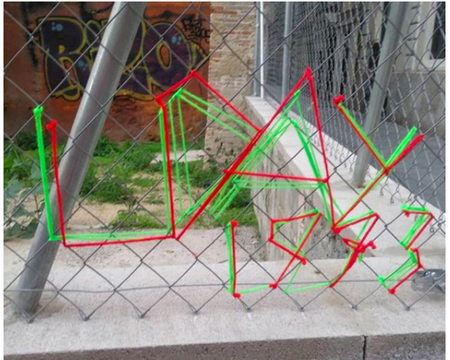
[Figure 11] Tag Uday 1973