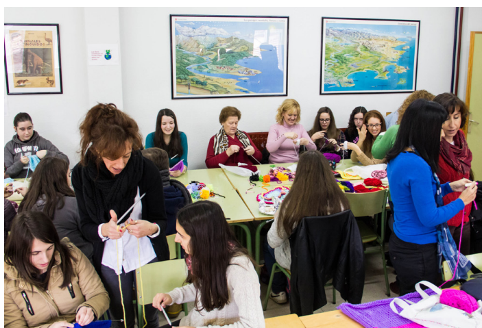
Guerrilla Crochet as a trans generational activity in an educational center. IES Francisco Nieva, Valdepeñas, Ciudad Real. Spain

[Figures 1 & 2] - These two pictures show the evolution of the activity of knitting from generation to generation.