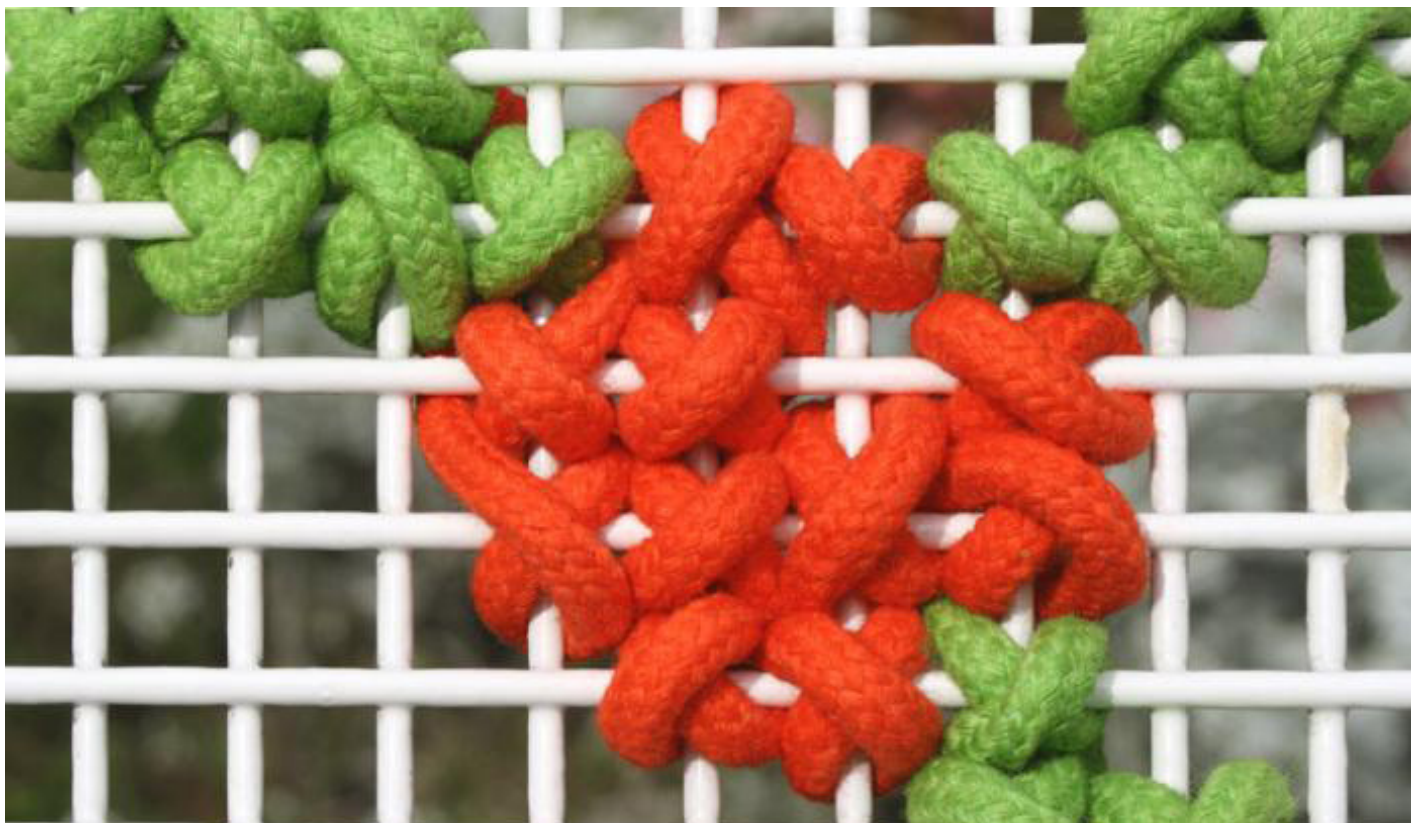
Figure 14 - Detail, Berlin 2010 by Miss Cross Stitch

the strong potential of soft interventions, plays the roles of the former heroines and explores textile metaphors too 42 :