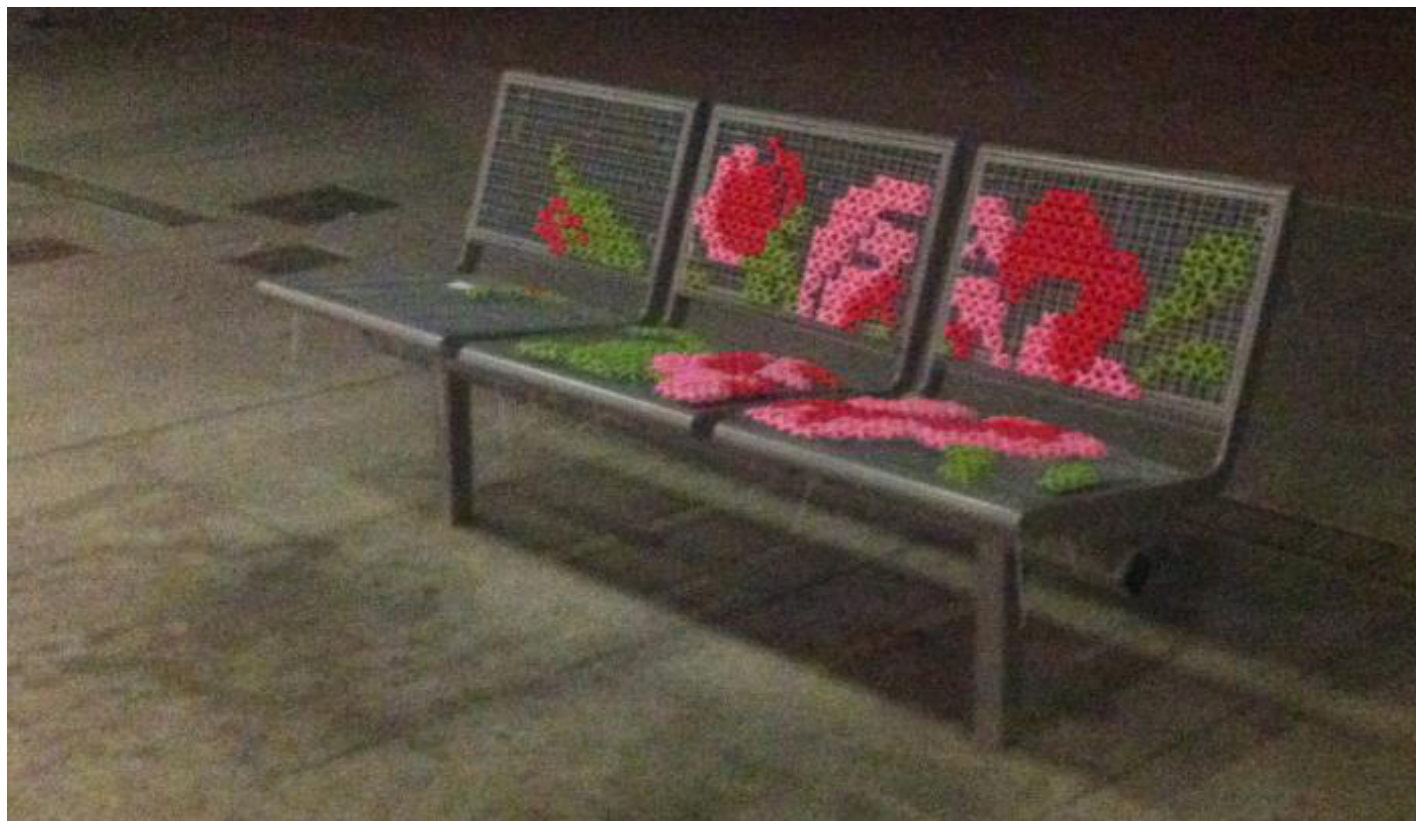
Figure 15 - Dresden 2013, Miss Cross Stitch

or at least certain textile traditions, knitting and embroidering have been more often than not developed in domestic interior spaces by women. Public space has been a masculine area for centuries and hence the most characteristic urban elements such as street poles, trees, bollards and sculptures are usually key targets of yarn bombing, part of a process of feminization or emasculation, 44 as well as a breaking of the dividing line between inside and outside, the private and the public. The simple relocation of the medium in public space challenges all the rigid associations of gender and gendered uses of space. The well-worn motto “the personal is political” manifests itself in all the actions that needle-based work in public space imply: “The city becomes an extension of the private as streets are decorated with objects usually found in private spaces” (Kuittinen12-13).