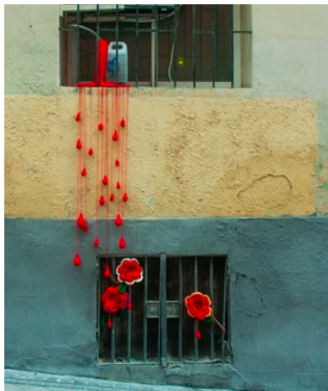
Figure 3: Lavapiés, Madrid, 2013 by Teje la Araña

Active since 2011, the work of the Spanish collective Teje la Araña (Valencia) sticks to a more traditional idea of yarn bombing. Lavapiés is one of the main areas where their interventions can be found; especially on the bollards in the street of the same name, where they return every November 7 th .