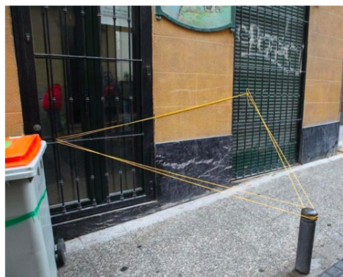
[Figure 9] - String Art by the collective Deb-van_deE

35 - Farinosi, M., Fortunati, L. “Knitting Feminist Politics: Exploring a Yarn-Bombing Performance in a Postdisaster City” in Journal of Communication Inquiry . 2018.