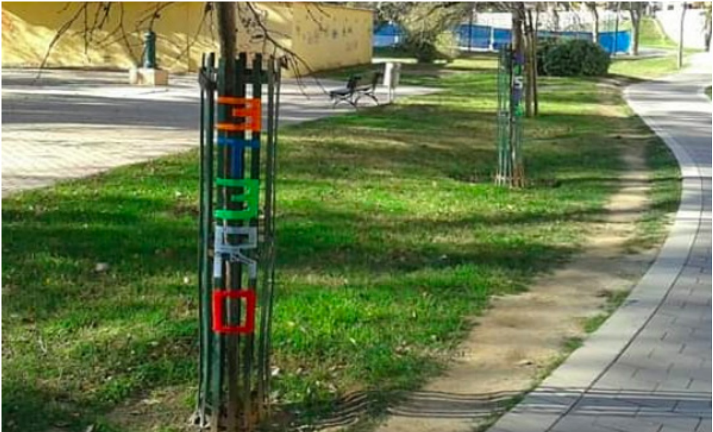
[Figure 12] Etero by Uday1973

USA 38 - today he sews his letters into city textures that can contrast with fabric like fences, balustrades, trash bins or handrails. At the beginning he was simply tagging his nickname, but later he incorporated messages ranging from poetry to activism – words and phrases from dating apps, gay codes, reclamation of urban fabric for neighborhoods or issues around social injustices.