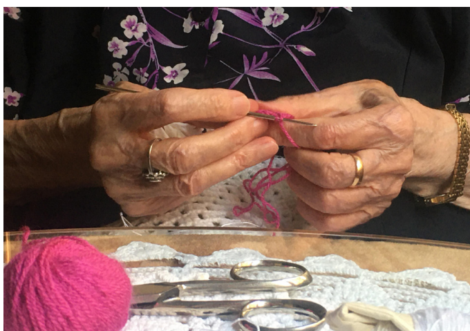
Author’s grandmother crocheting

19 - Following the popularity and increased interest in knitting as a hipster activity that challenges the traditional feminine-masculine and domestic-public dichotomies, in 2005 Danielle Landes launched the World Wide Knit in Public Day that it is celebrated on the second Saturday of June and that it is open to any knitting group around the World. The event’s motto and first motivation was to prove that “not only grannies knit”: https://www.wkkip-day.com/