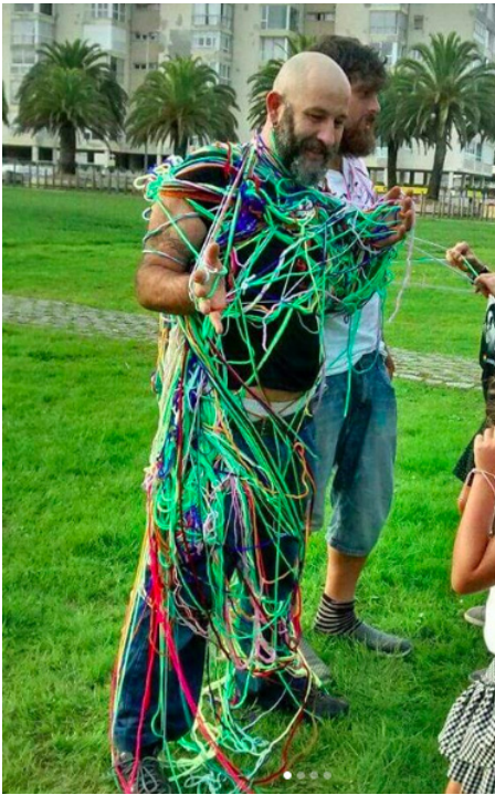
[Figure 10] Happening by the collective Deb-van_deE